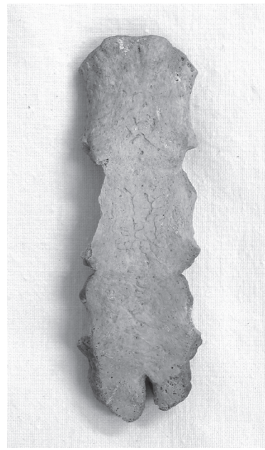
Figure 2. Sternum bifidum (grave 1774, adult, male).

719 cases characteristics of females can be seen. During the excavation, as a result of the careful rescue, the remains of 39 fetuses were rescued (included in the Infantia category). Unfortunately, in case of 123 (3.18%) skeletons, neither the sex, nor the age at death was determinable.