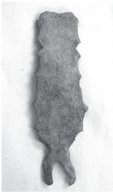
Figure 1. Bifurcation of the xiphoid process (grave 2114, Mat., male).